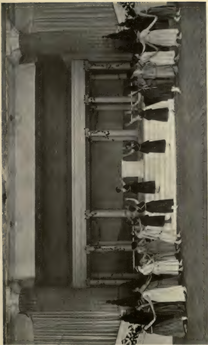
RAISED BACK STAGE AND GROUPING (Greek Games — Barnard)